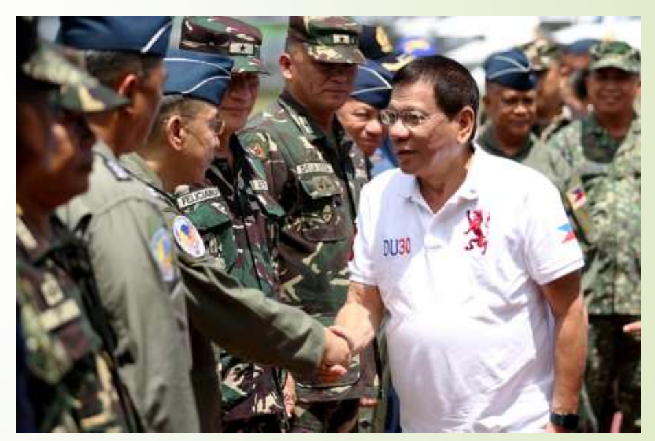
With the NPA Commander-in-Chief